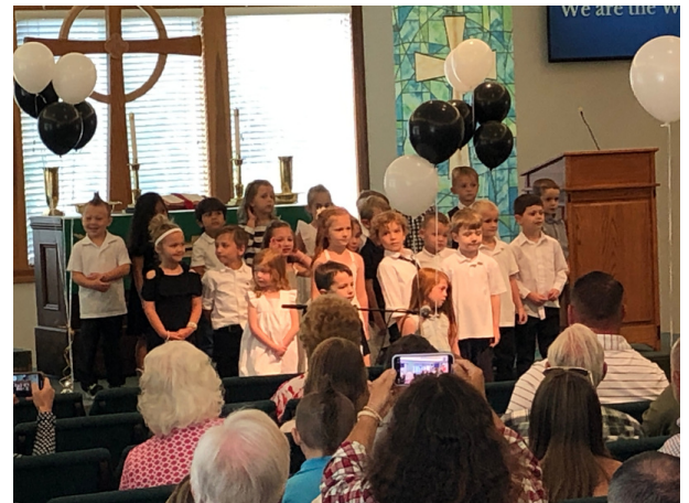
We are so proud of our graduates from Crossroads!